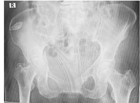
Fig.2 : Radiographic image of right acetabular fracture.

vomiting which settled after pantoprazole infusion and anti-emetics. The next day patient was in a stable condition except for complaints of pain in the right hip joint along with inability to mobilise the limb. Xray Imaging was done which was suggestive of right acetabular fracture, as per consultant orthopaedician inputs the fracture was managed conservatively.