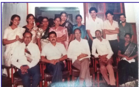
MMC - 1985 Unit Party