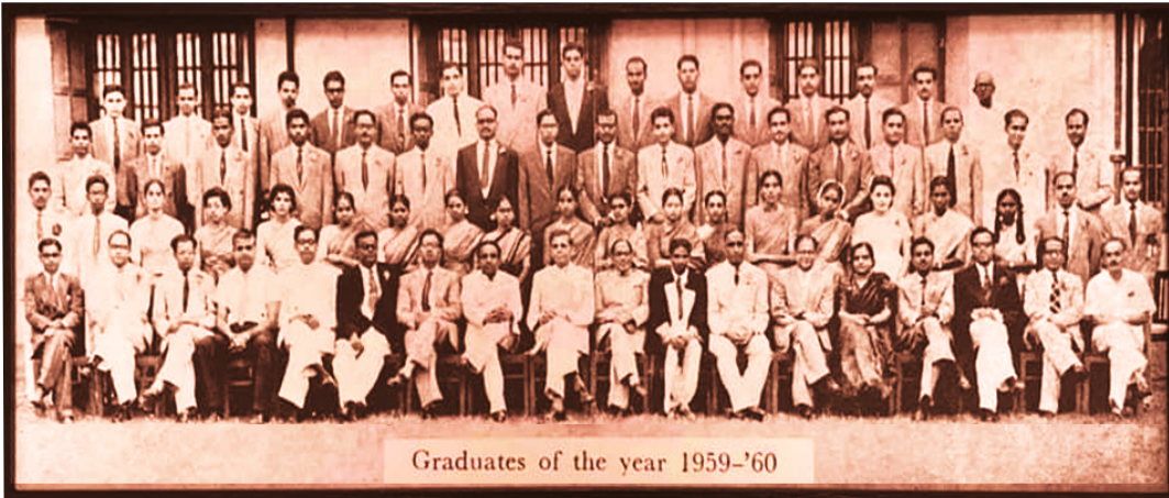
Graduates of the year 1959-'60

‘A GOOD TEACHER IS LIKE A CANDLE IT CONSUMES ITSELF TO LIGHT THE WAY FOR OTHERS’